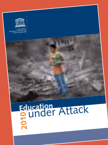
Education under Attack 2010 Brendan O'Malley (forthcoming)